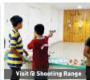
Visit @ Shooting Range